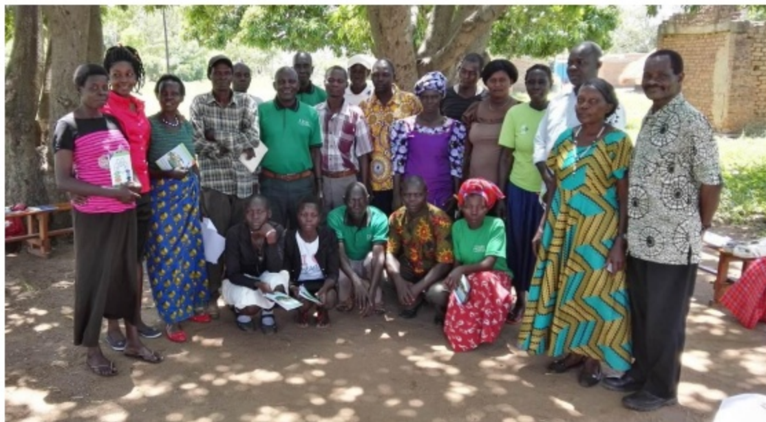
UPLIFT Mentors and Coordinators

13 new individuals were recommended by communities in both Nebbi and Zombo to be trained as mentors. Out of these, 6 mentors completed their on-the-job training and were awarded certificates.