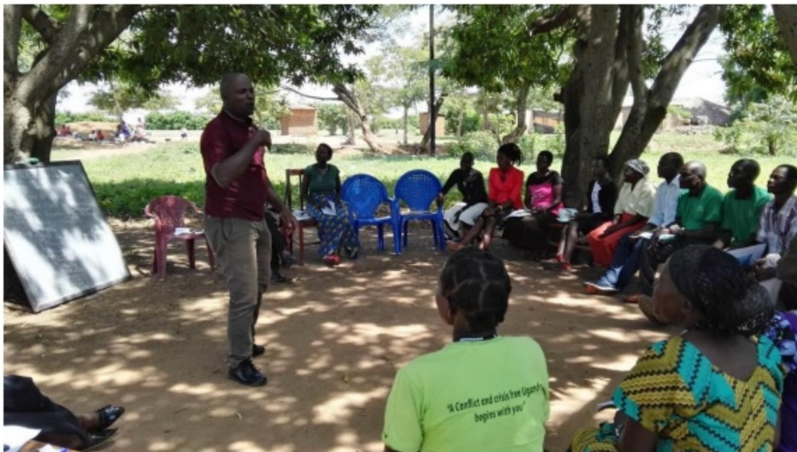
UPLIFT Mentors and Coordinators during refresher training in Agwok

From this quotation mentors understood that they can become better mentor if they work even harder during tough times.