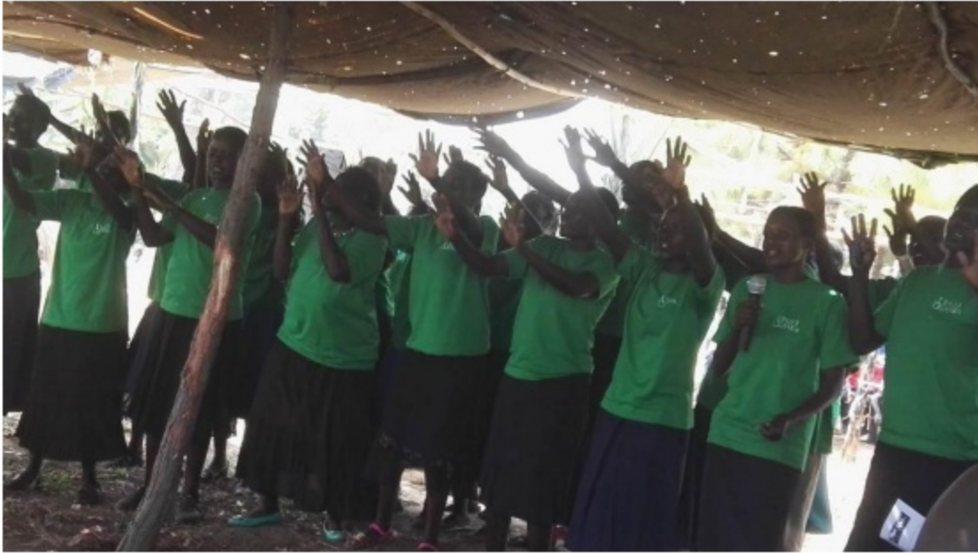
UPLIFT Learners performing at the Graduation ceremony

In the same ceremony, a cup donated by Friends of UPLIFT was presented to the best performing Sub County and this time it was given to Erussi Sub County.