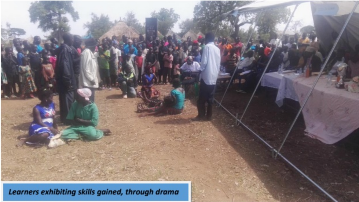
Learners exhibiting skills gained, through drama

Tailoring students who were certified also left confident and sure of a new carrier in their lives and were inspired to go back and use the acquired skills and certificates to start a self-sustainable life.