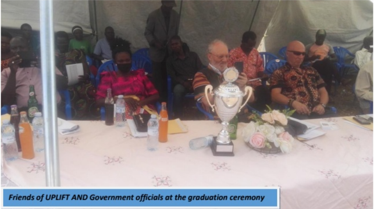
Friends of UPLIFT AND Government officials at the graduation ceremony