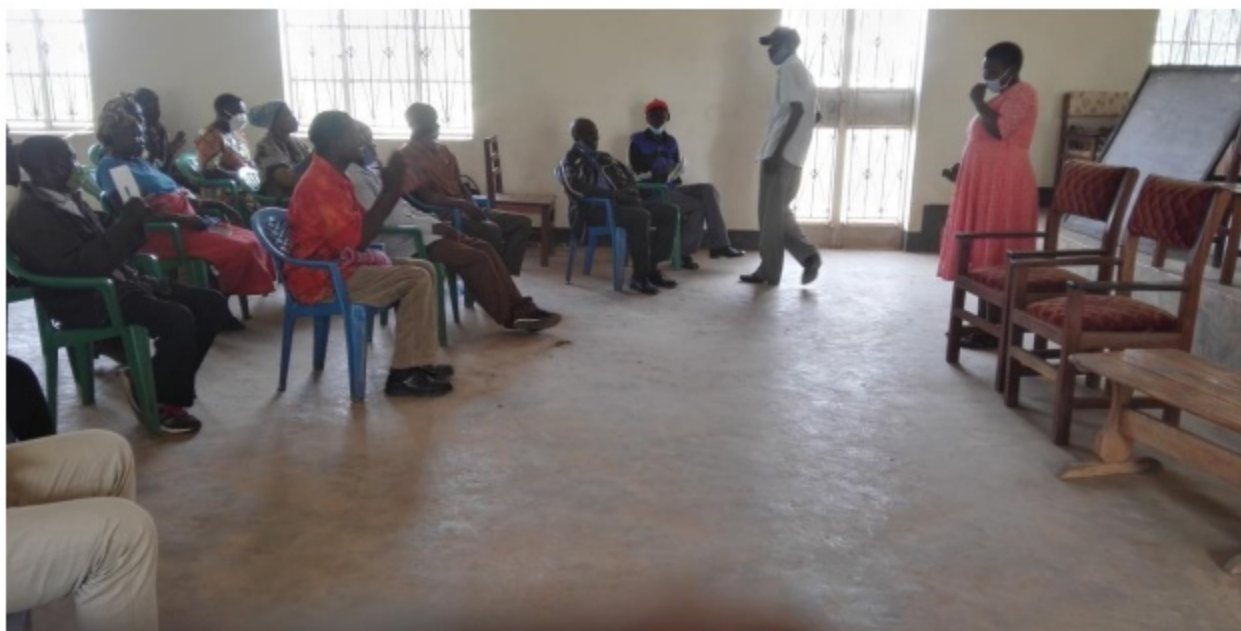
Refresher training at Nyapea Sub County , Zombo District

Four refresher trainings were conducted: two in Nebbi and two in Zombo, with over fifty mentors participating.