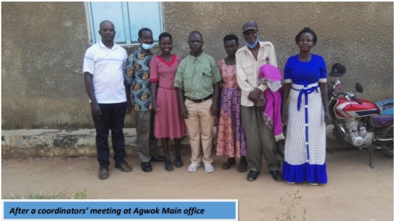
After a coordinators' meeting at Agwok Main office

Four coordinators meeting were held, no trainee coordinators were trained, and academic upgrading of mentors was hindered by lack of enough funds to send some of the coordinators for further studies.