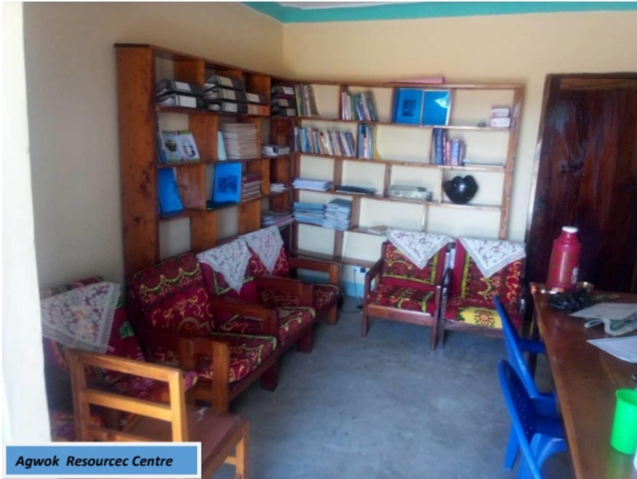
Agwok Resource Centre